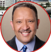
Marc H. Morial