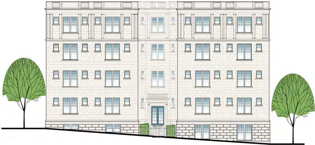
PROPOSED COURT STREET EXTERIOR ELEVATION 1/4"=1'-0"